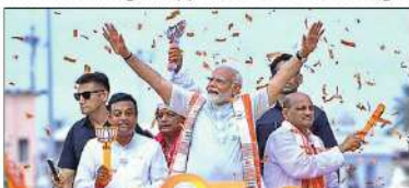
Modi with BJD Puri candidate, Sambit Patra, on Monday

New Delhi | Kolkata: Prime Minister Narendra Modi charged the Naveen Patnaik-led BJD government in Odisha and the Mamata Banerjee-led TMC regime in West Bengal with corruption and an extremely slow pace of growth which has kept its farmers, youth and tribals in poverty and degradation for the last 25 years. In his election campaign in Odisha, Modi sought votes for BJP to establish a double-engine government that would lift the state from its misery.